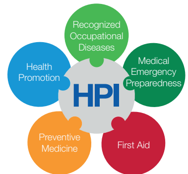
The five components of the BASF Health Performance Index

The HPI was developed by BASF along the requirements of the Global Reporting Initiative™ (GRI) (Table). The GRI key indicators LA7 and LA8 cover topics from the fields of occupational medicine and health protection.